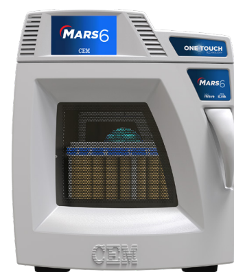
Figure 2. MARS6

Samples run for trace elements on Agilent ICP-MS 7900 using Meinhard nebulizer with cyclonic spray chamber using the lines reported in Table1. Supplemental helium gas was used to improve the response of arsenic and chromium.