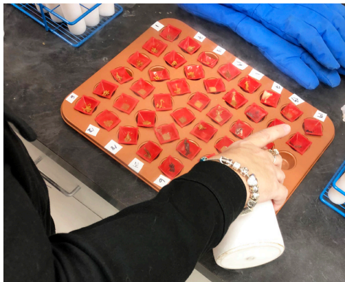
Figure 1. Sample Preparation of Bread Spreads

Bread spreads were frozen using liquid nitrogen by applying a known amount of sample to a silicone non-stick mold and pouring liquid nitrogen over the sample multiple times in order to flash freeze the sample, Figure 1. This was done to ensure that all of the sample reached the bottom of the digestion vessel, a task which is difficult when bread spreads are at room temperature.