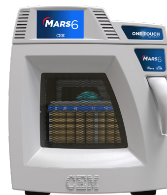
Figure 2. MARS6 with iWave temperature sensor