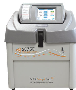
Figure 1. SPEX SamplePrep Freezer/Mill®